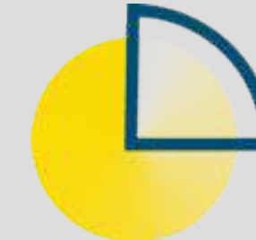
Non Banking Financial Institutions