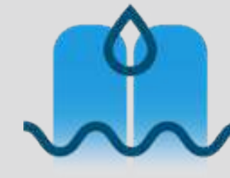
Water and Sanitation