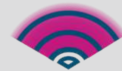
Telecommunications, Media and Technology